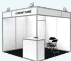
Exhibit Space Cost