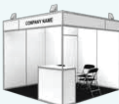
Exhibit Space Cost